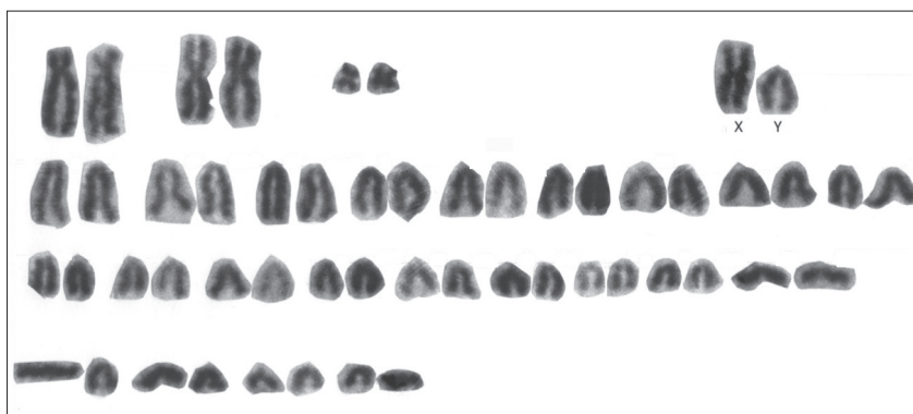
Fig. 1. Karyotype of male Microtus subterraneus , 2n=52 from the locality Vlasina (south-eastern Serbia).