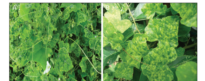
Fig. 1. Ivy gourd plant showing severe mosaic ( A ) and mosaic and mottling symptoms under natural conditions ( B ).

By visual inspection, the most commonly observed symptoms were mosaics, blistering, reduction in leaf size and stunted growth of plants (Fig. 1), with the incidence of disease up to 60 and 70% in New Delhi and Uttar Pradesh, respectively. Total DNA isolated from 16 ivy gourd samples (12 from Uttar Pradesh and 4 from New Delhi) were amplified by PCR using begomovirus-specific primers. A PCR amplicon of a 1.2-kb fragment was cloned and sequenced and showed more than 95% nt identity with ToLCNDV. Therefore, only two samples (IVG1-ND and IVG2-Var) were selected for complete characterization by the RCA method. Sequence alignments using the Muscle method in SDT Version 1.2 showed that the begomovirus clones from India share only 90% nt identity among themselves, indicating that these two ivy gourd isolates (IVG1-ND and IVG2-Var) are two different strains of ToLCNDV